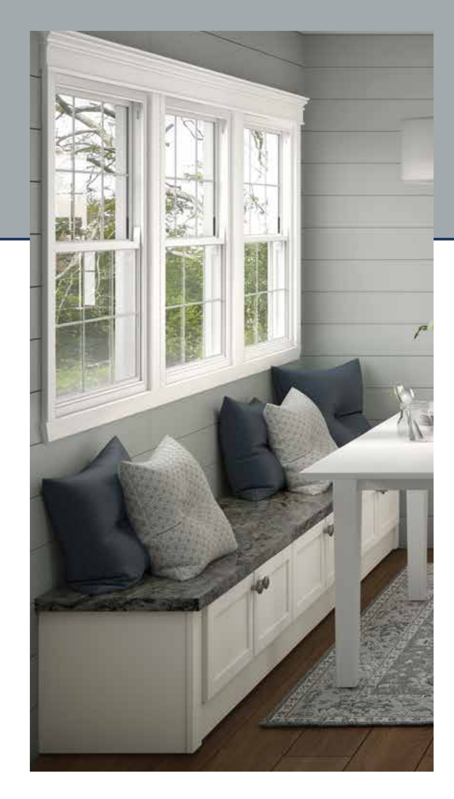
KITTERY BIRCH IN COTTON