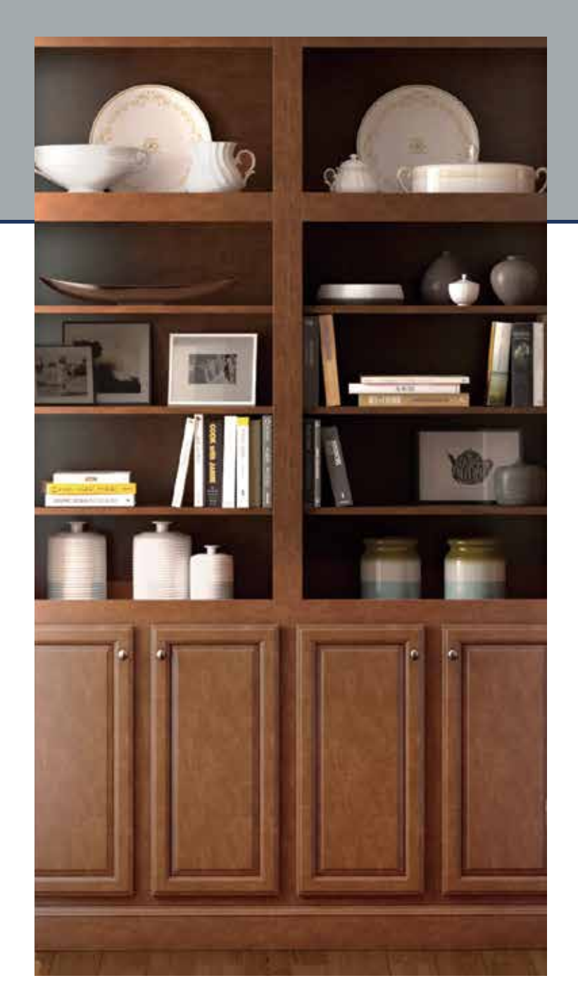
HARBORVIEW BIRCH IN CLOVE