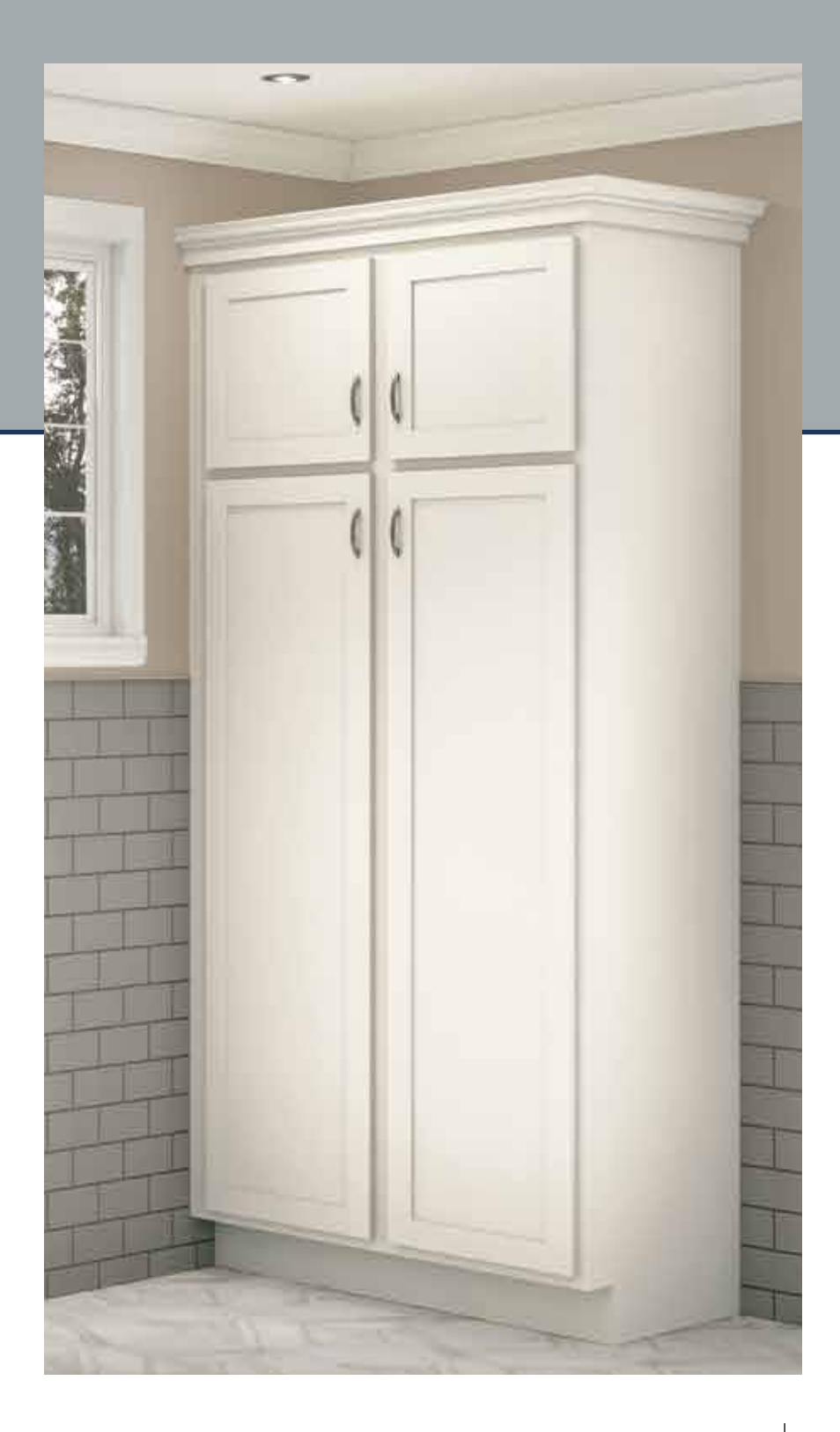
MADDIE LAMINATE IN WHITE