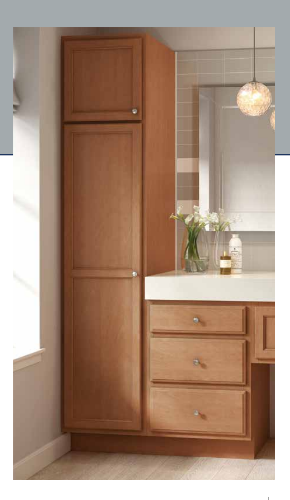
SEACREST BIRCH IN MIRAGE