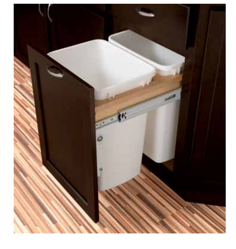
When paired with a sleek twilight finish, Derby's modern style is a perfect contemporary choice at a great price point.